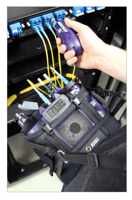
HP2-60-P4 shown with utility carrier and other tools.

The HP2 system, derived from the popular HD2 Series, provides high-quality image resolution in a compact, portable design. The integrated power meter offers quick, easy, and convenient field measurement of optical power and attenuation. Easy pushbutton operation makes the device simple and straightforward, while the inspect-test process establishes optimal workflow practices.