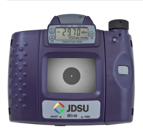
HP2-60-P4 Fiber Inspect and Test System with Integrated Power Meter and Patch Cord Microscope