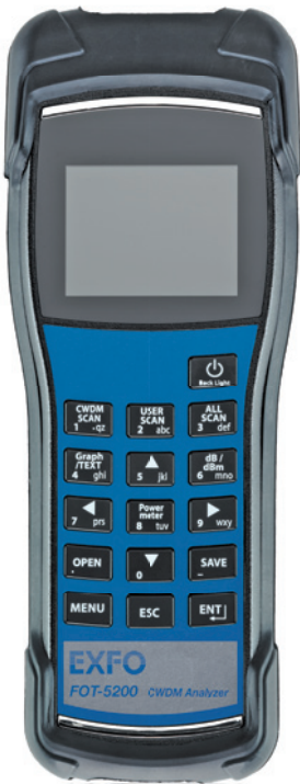
Front view of the FOT-5200