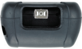
Top-side view of the FOT-5200