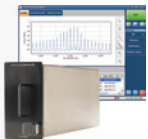
Optical Spectrum Analyzer FTB-5240S