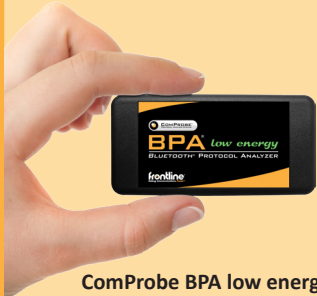
ComProbe BPA low energy Bluetooth Protocol Analyzer