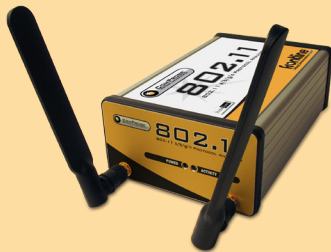
ComProbe 802.11 Protocol Analyzer