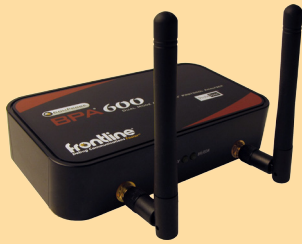
ComProbe BPA® 600 Dual Mode Bluetooth Protocol Analyzer