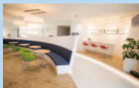
After a tour, have a relaxed time at FUKIAGE FORUM on the second floor.