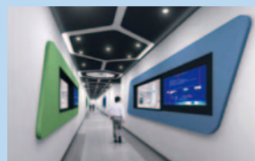
The new TECHNO LAB offers a tour of the manufacturing process and evaluation test (reservation required).