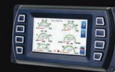
Color Display for Operation, Status and Diagnostics