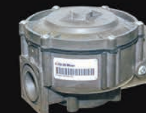
Air / Fuel Management Mixer