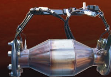
Integrated Catalyst/ Sensor Package