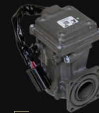
Air / Fuel Management EPR Electronic Pressure Regulator