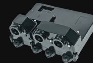
Engine Control Module (ECM) - Ignition - Regulation - Air/Fuel Ratio - Reporting - Diagnostics - Local/Remote - Efficiency - Speed Governing