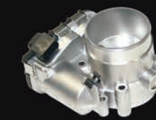
Electronic Governing/ Suction Pressure Base Speed Control