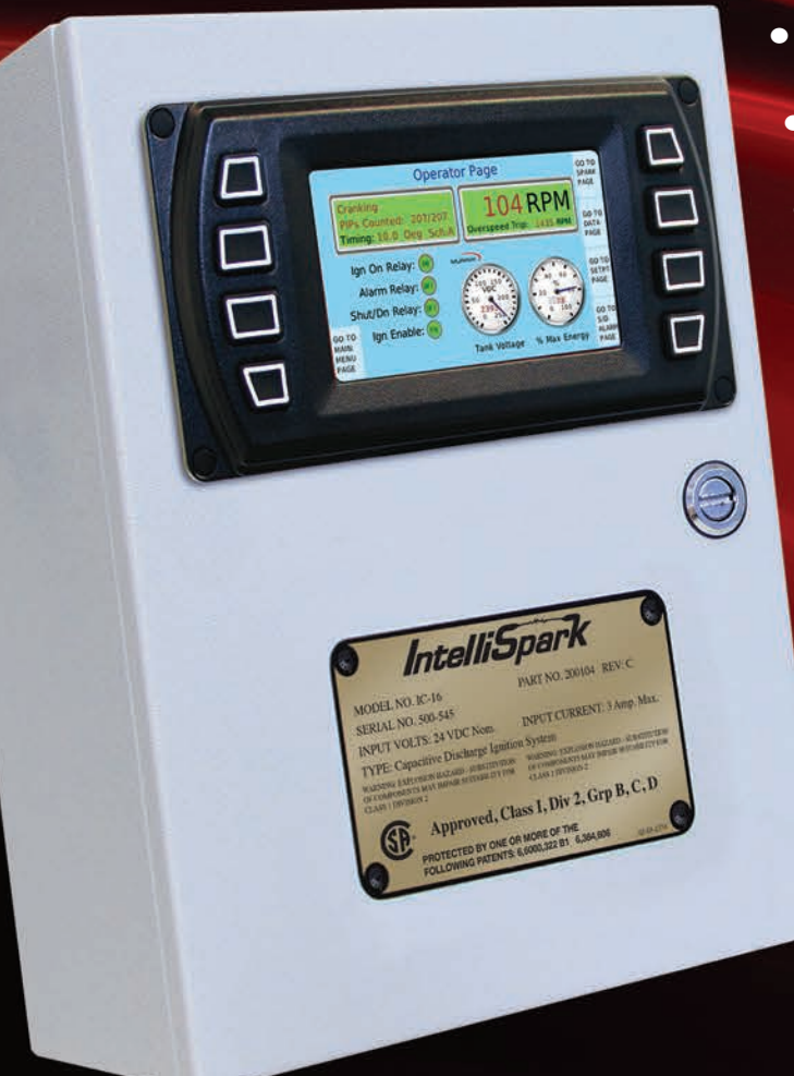
CSA certified for Class I, Div. 2, Group B, C & D.

IntelliSpark Systems put you in control of your ignition. This advanced unit offers: