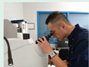
Varian 600 UMA FTIR Microscope