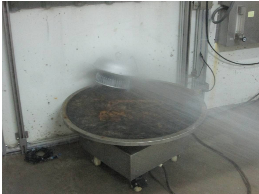
IPX6 after the test