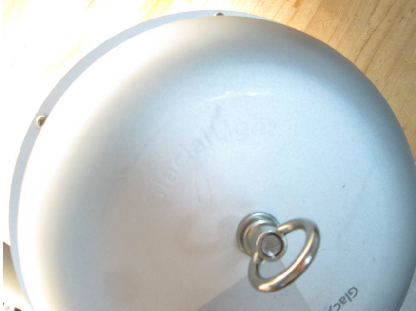
IP6X after the test