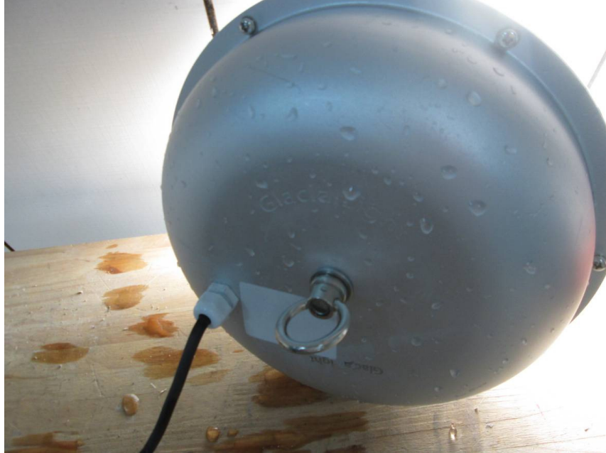
IPX6 after the test