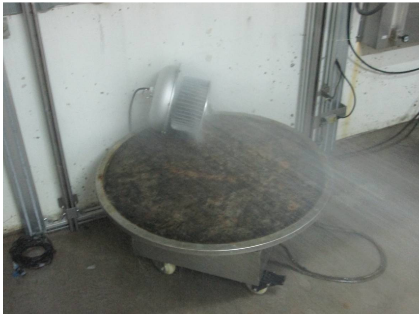
IPX6 after the test