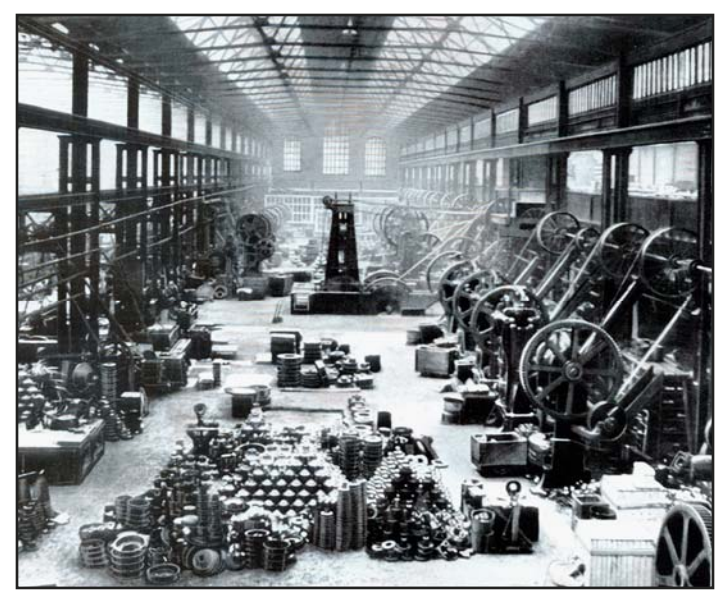
A general view of the press shop in the early 1920s.

In 1971 Braime founded a new subsidiary: