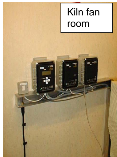
Kiln fan room

Technology ♦ Innovation ♦ Quality ♦ Value