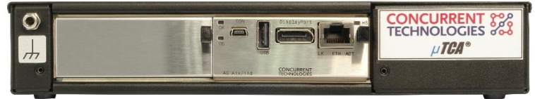
Option Example: RapidIO Pico System with GPGPU AMC