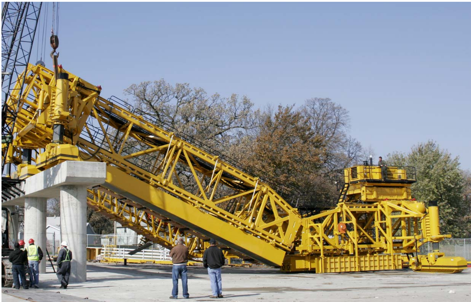
The All-American Canal paver features framework that is 10 feet (3 m) tall with a GP-4000 prime mover. It also has a powered wedge that allows the paver to be adjusted to the different angles caused by the changing widths and slopes of the canal.