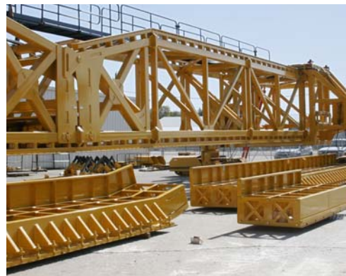
Modified 5000 series paving molds wait to be attached to the canal paver during assembly.

The inserter is made of eight foot by eight foot (2.4 x 2.4 m) frame sections, with the outside dimensions the same as the paver. It will feature a fixed and hydraulically-adjustable end car and powered wedge similar to the paver to