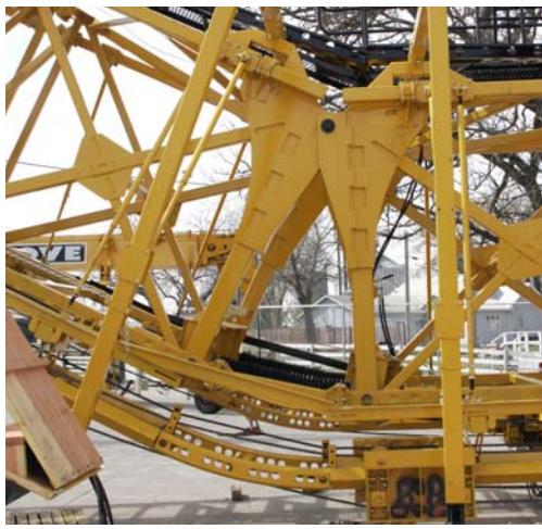
The powered wedge system allows the machines to go from flat to varying degrees of slope.