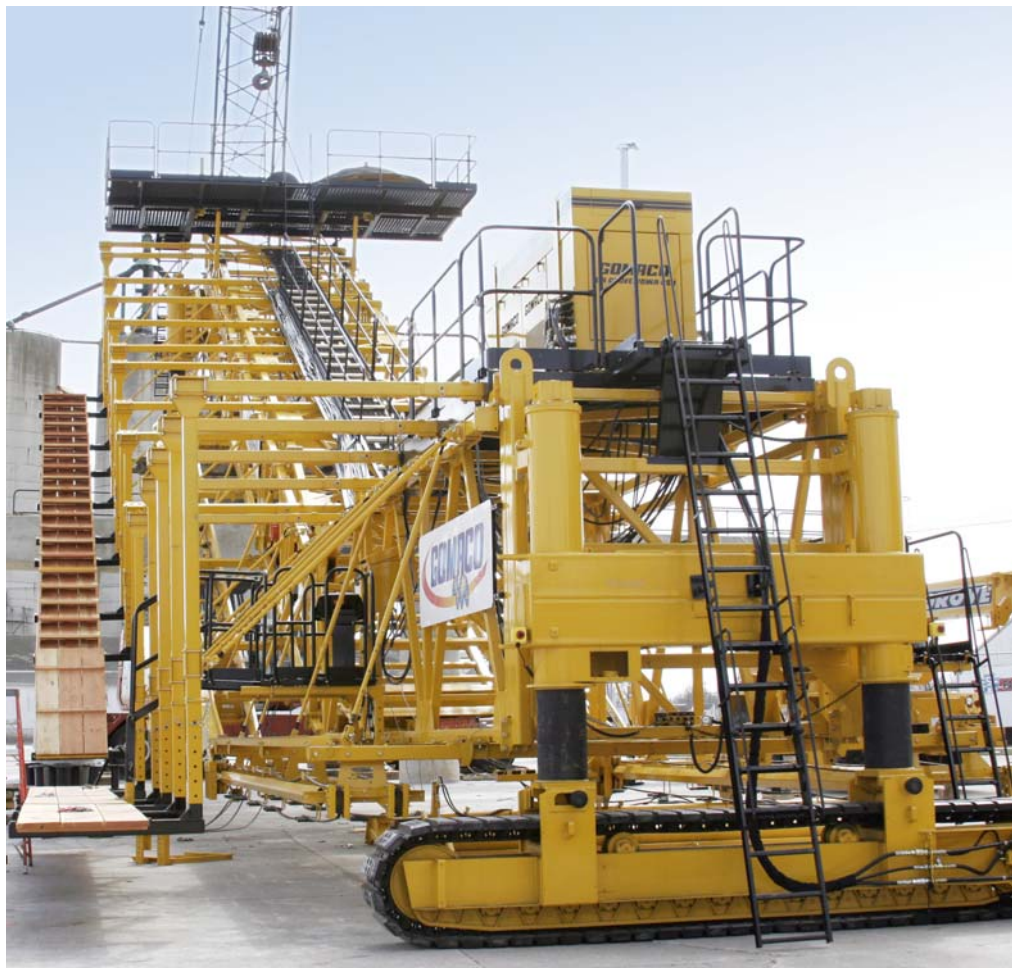
The water stop inserter machine has a specially designed inserter mechanism to place the rubber water stop material into the concrete every 15 feet (4.6 m) to form the transverse joint.

"The concept itself is relatively easy," Homan explained. "But in the environment the inserter has to work in, the complications of going through a radius, and other aspects make this an interesting challenge and this a very important machine in the canal paving process."