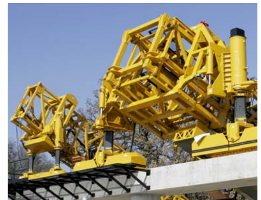
Adjustable end cars on the machines hydraulically slide for width changes.

A 17 foot (5.2 m) long cylinder and float pan follows the inserter. The cylinder helps finish and seal the surface of the canal.