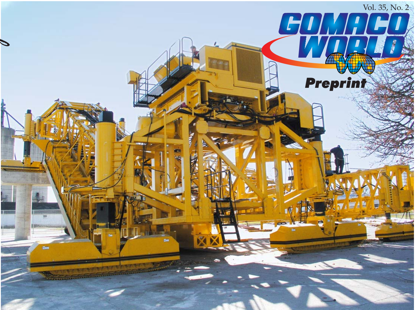
The paver and work bridge for the All-American Canal sits on the pier at GOMACO's testing facilities in Ida Grove, Iowa.