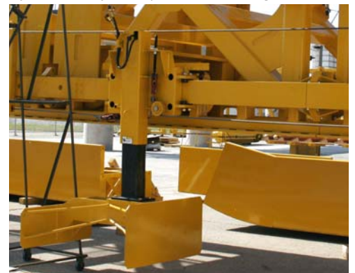
The spreader-plow moves the concrete across the bottom section of the canal floor.