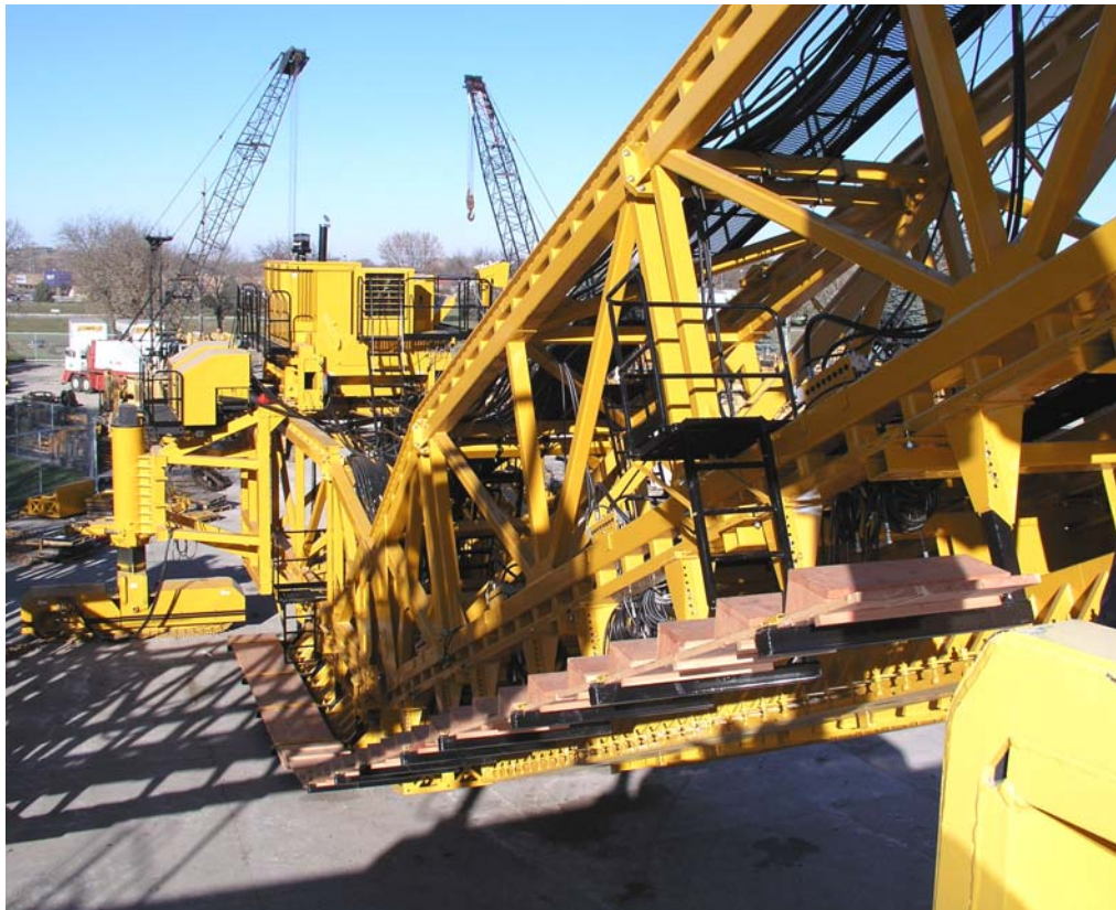
On the testing pier— the pier simulates the slope of the canal and allows engineers to test the different features on all three pieces of canal equipment.