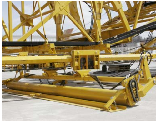
A 17 foot (5.2 m) long finishing cylinder with float pan will finish and seal the surface of the canal.

The water stop machine has to be able to keep up with the paver so the concrete doesn't cure and become too hard to insert the material. That's one challenge. Another challenge is project specifications.