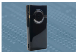
Digital Video Cameras