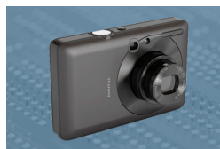
Digital Still Cameras