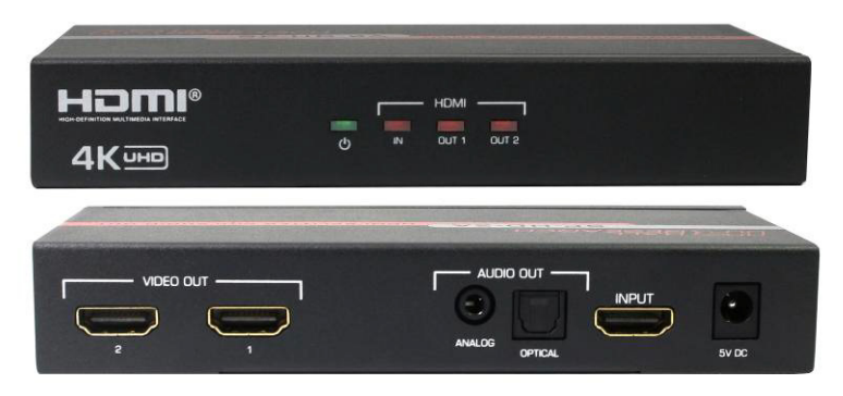
Figure 3 – Front and Rear Panels

If source is sending multi-channel audio, the 3.5mm analog output is muted and extracted audio output will only be available as digital on the TOSLINK optical output.