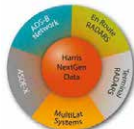
Surveillance data fused from multiple air traffic control systems

Harris Corporation is a leading technology innovator, solving customers' toughest mission-critical challenges by providing solutions that connect, inform and protect. Harris supports government and commercial customers in more than 100 countries and has approximately $6 billion in annual revenue. The company is organized into three business segments: Communication Systems, Space and Intelligence Systems and Electronic Systems.