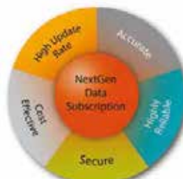
A single source of real-time aircraft surveillance data for all aviation stakeholders

Customers may purchase the data feed in its entirety or as separate data segments, including terminal area, surface, user-defined geographic regions, user-defined altitude bands and fleet [specific airline assets] information.