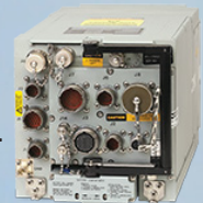
Multifunction Information Distribution System (MIDS) Low Volume Terminal (LVT) 1