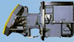
Active Electronically Scanned Array (AESA) Fibre Channel Switch