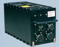
Digital Map Computer (DMC) Digital Video Map Computer (DVMC)