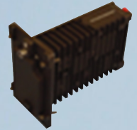
Digital Memory Device (DMD)