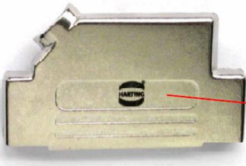
Original position of the Logo