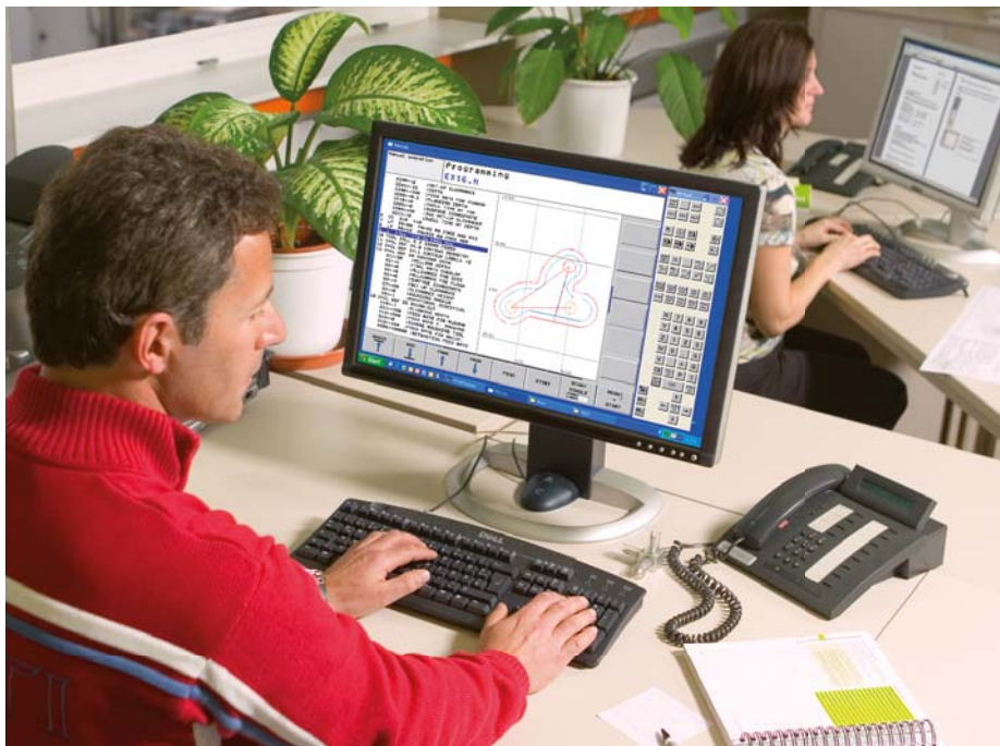
Programming station with virtual keyboard