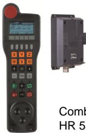
Combination of HR 550FS and HRA 551FS

Please note the " Servicing procedure " at right.