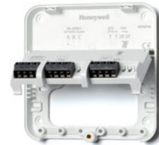
Receiver box back plate