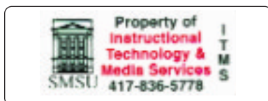
Two+-Color Style (Unlimited Colors) Block type, stylized type or logos any standard color, PMS match color or 4-color process.

STEP 3 - Determine Serialization: Specify bar code and/or human-readable characters, then determine number of characters. Our standard symbology is Code 39; you may select alphanumeric characters. Please use the following guidelines to determine size of label and number of characters which you may use for the serial numbers.