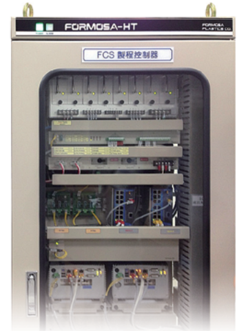
The FORMOSA-FX system uses NEXCOM NISE 3660 as a DCS controller.

control processes, including MMI, control, and I/O. The solution has been used in power generation, cogeneration processes, and midstream and downstream processes.