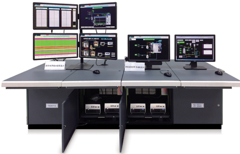
The FORMOSA-FX DCS uses NEXCOM NISE 3660 as an MMI.

With all of the different factory environments in mind, FPC developed a best-of-breed DCS solution that works across multiple