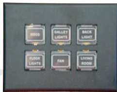
6 button Pushbutton Panel

The initial offering includes 2 accessory options: 00-00904-000 6 button Pushbutton Panel 00-00905-100 10 button Pushbutton Panel