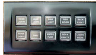
10 button Pushbutton Panel