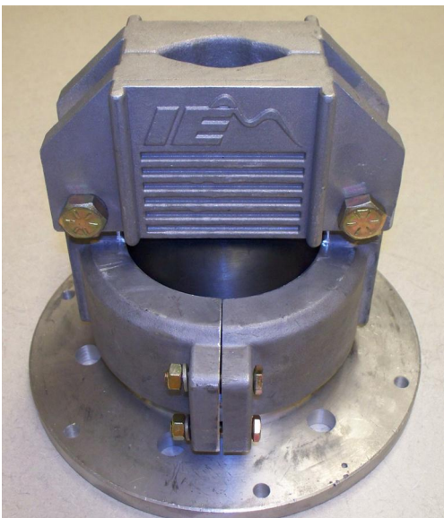
Intermountain Electronics Cable Gland