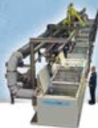
Surface Treatment Tank Lines