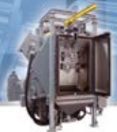
Slurry Blasting Cleaning