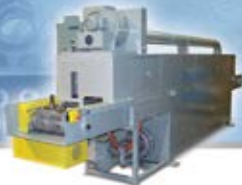
Aqueous Parts Washers