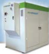
Wastewater Treatment Systems