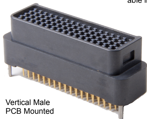
Vertical Male PCB Mounted

All cable end connectors are female. There are board mounted headers available in vertical male, right angle male, vertical female and right angle female configurations. The female board connectors are for board to board connection in conjunction with the male board connectors.