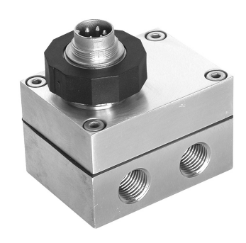
Low Pressure Version

So that the differential pressure can also be measured exactly if the standard pressure range/ differential pressure ratio is high, this series also features the tried-and-tested microprocessor-based technology that is used in Series 30 X. All reproducible pressure sensor errors (i.e. non-linearities and temperature dependencies) are entirely eliminated thanks to mathematical error compensation. The sensor signals are measured with a 16-bit A/D converter, so the individual standard pressure ranges can be measured to an accuracy of 0,05%FS throughout the entire pressure and temperature range.