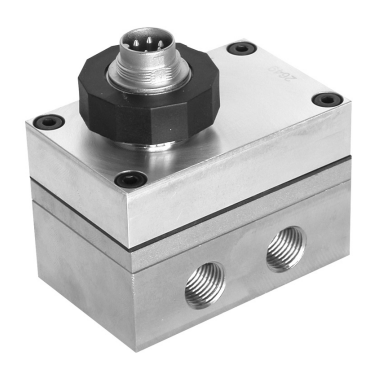
Medium Pressure Version