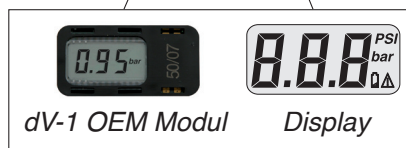
dV-1 OEM Modul in Lackierpistole