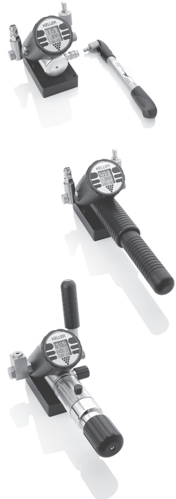
High Pressure Calibrator Outline Drawing

The Standard-Version is limited to the essential features for precision pressure generation only. For this simplified operation, this version does not include the integral transmitter supply, nor the display of the transmitter signal. Thus it does not incorporate the Pst and Lin functions.