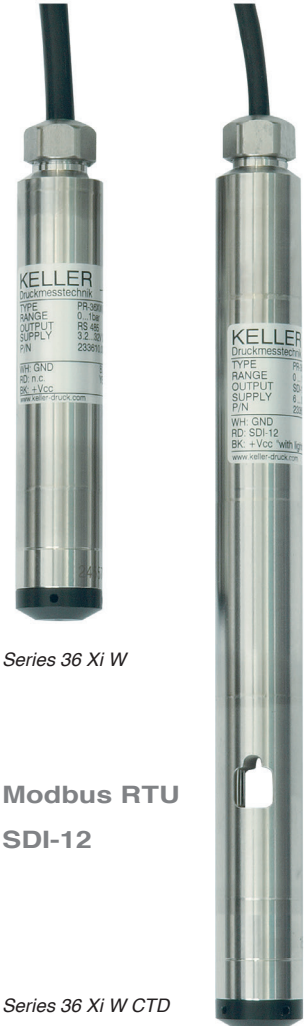
Series 36 Xi W