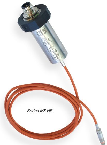
Series M5 HB