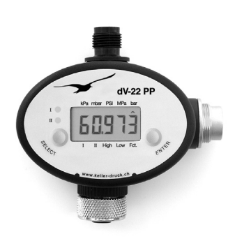
dV-22 PP Programming Unit (optional)