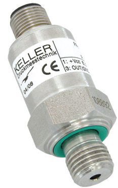
Series 23 SY

The Series 23 SY / 25 Y product line is outstanding due to its extreme ruggedness towards electromagnetic fields. The limits of the CE standard are undercut by a factor of up to 10 with conducted and radiated fields.