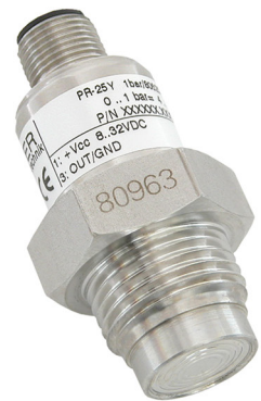
Series 25 Y

A modular concept is used, with fast and economical production achieved by using off-the-shelf sensors. Numerous options and variations are available to meet customers' specific requirements: Pressure ranges, pressure ports, signal outputs, electrical connectors, etc.