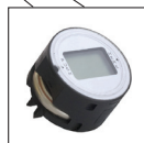
dV-1 OEM module in compressed air gun