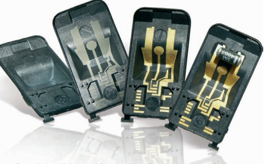
2 From a simple molded part to a fully equipped three-dimensional interconnect device

The LDS process has already achieved success in a wide range of applications.