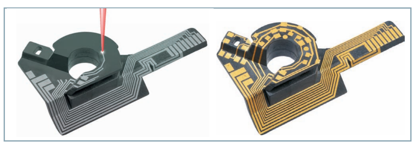
4 The layout of a structure can be adapted on the computer in little to no time and immediately transferred to the component

► The system saves the production data and all parameters, and this can then be retrieved at any time. The software supplied distributes the control data to each individual laser head, thus optimizing cycle times. In conjunction with robotic automation, this guarantees speed, accuracy and maximum reproducibility while simultaneously minimizing personnel costs and downtimes. The Fusion3D is designed for continuous operation. It combines great flexibility, efficiency and short times to market with the option of mass production – which also recommend it for many other applications.