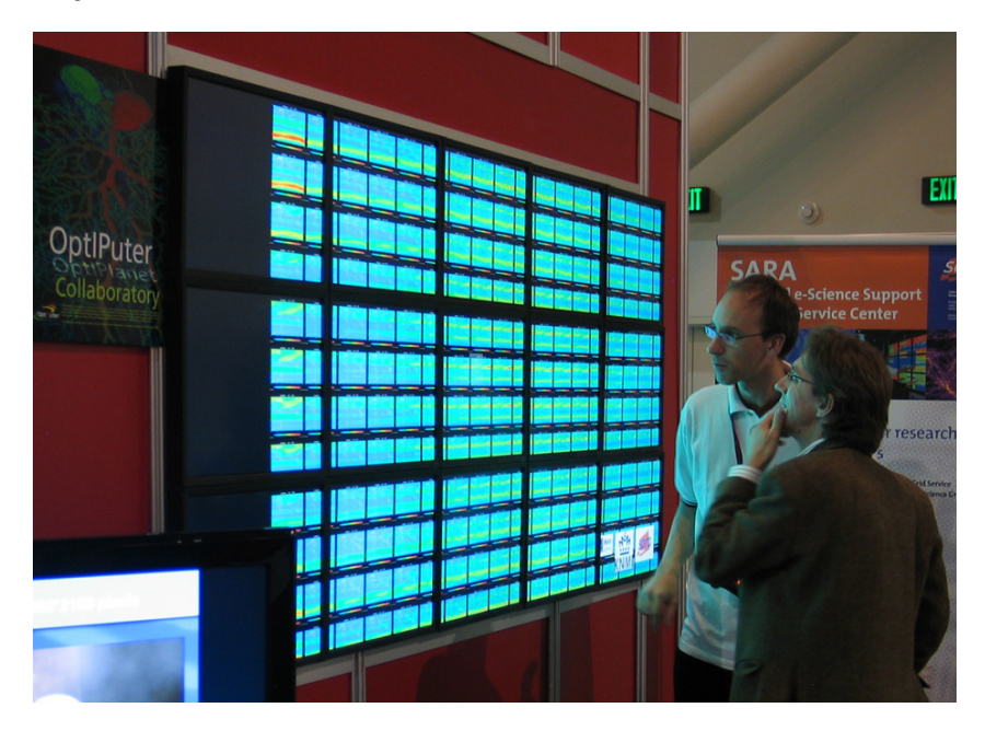
Fig. 2. SARA's ESSENCE, project, part of the DEISA Extreme Computing Initiative, computes a statistical estimate of internal climate variability to obtain a signal-to-noise ratio to better distinguish internal variability from the forced signal due to the increase of greenhouse gases. In large parts of the world, the observed warming over the last 60 years is statistically indistinguishable from the warming forced by increased greenhouse gas concentrations. This methodology is proving effective in both verifying the existence of known phenomena, such as El Niño, and finding possible new phenomena, such as superstorms and new modes of oceanic and atmospheric variability. SARA designed and implemented a web-based system so scientists could select a subset of the data, select a representation form, optionally perform statistical operations on the data, and then stream over lightpaths to a scientist's local OptiPortal.