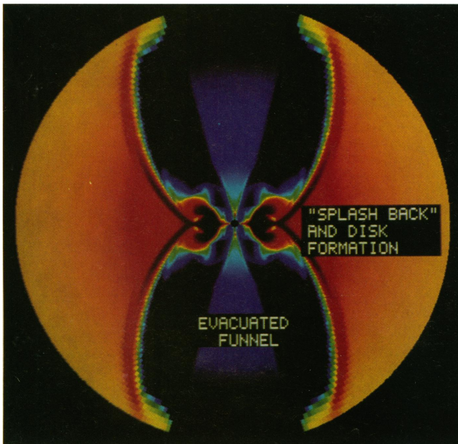
Fig. 2. The gas flow, in the thick-inflow case, at the moment the gas begins to splash back from the funnel wall near the hole. The quantity represented is density. The color scheme and features are explained in detail in the text.

Just how prevalent is the phenomenon of complexity? Wolfram (15) gives an excellent overview of this question with particular emphasis on why the computer is so well matched to the study of complexity. It seems that most systems in nature can exhibit both simple and complex behavior. To date, theoretical physics has mostly concerned itself with simple behavior, since analytic tools were well matched to that study. However, as computational resources become more powerful and accessible, more studies are being performed on the complex behavior of simple systems.