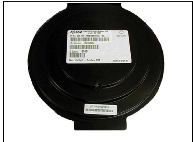
Figure 2: Shipper & Label