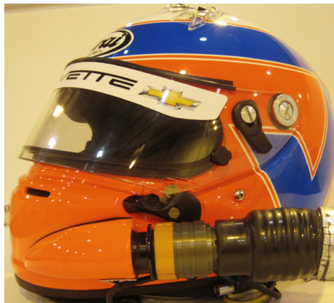
The actual driver's helmet showing the connector parts designed using NX software.

"Pratt & Miller Engineering also uses the NX CAD software, which greatly simplified things. However, Dallara, an Italian company, utilizes another software system, so we do a lot of importing and exporting."