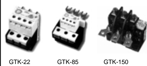
GTK-22 GTK-85 GTK-150