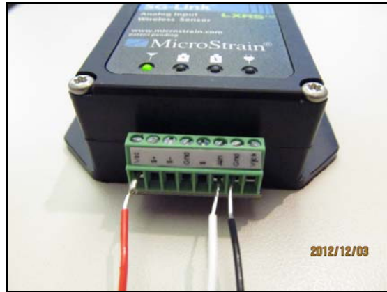
Figure 2. DEMOD-DC ® wiring for SG-Link ® -LXRS ™