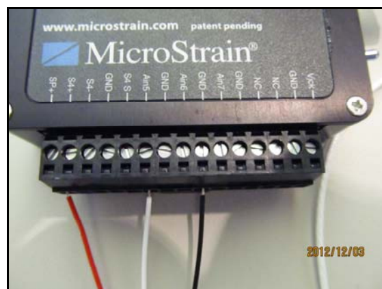
Figure 1. DEMOD-DC ® wiring for V-Link ® -LXRS ™