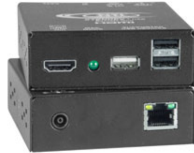
XTENDEX® ST-C6USBHU-300 (Remote and Local Unit)

The XTENDEX® HDMI USB KVM Extender provides remote KVM (USB keyboard, USB mouse and HDMI monitor) access to a USB computer up to 300 feet (91 meters) over CAT5/6/7 cable. Each ST-C6USBH-300 consists of a local unit that connects to a computer, and a remote unit that connects to a keyboard, monitor and mouse. The local and remote units are interconnected via CAT5/6/7 cable.