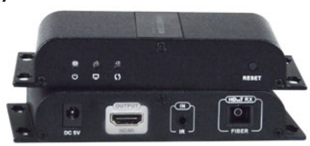
XTENDEX ST-FOHD-SC-ULC (Remote and Local Unit)