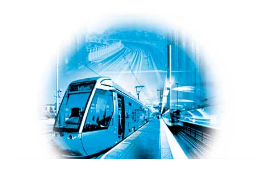
Cable solutions and services For Urban Mass Transit security