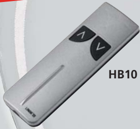
HB10 RF handset