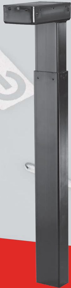
DL5 Lifting column