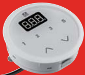
DPT Desk Panel