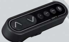
DPF1M Desk Panel