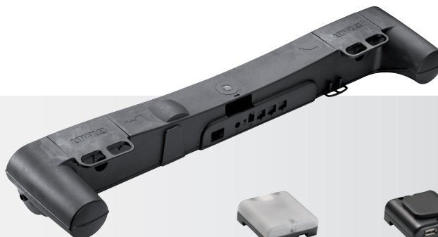
TD3 dual actuator

The TD3 TWINDRIVE® system is the most complete and modular system for leisure beds available on the market. -Especially developed to comply with the need for more force in beds and adding more value on the bed for the end-user.