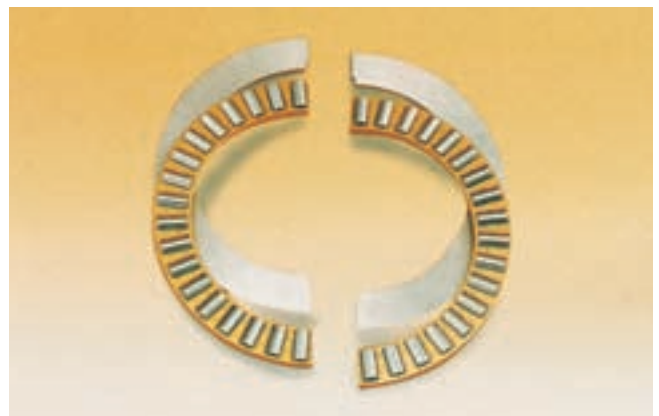
Propeller shank bearings

Major propellers in which NTN bearings are employed 63E60 (HAMILTON STANDARD LICENCE) 54H60 (HAMILTON STANDARD LICENCE)