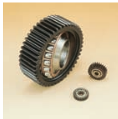
Reduction gear bearing