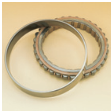
Main shaft bearing

RJ500 (Joint Development of Japan and England), V2500 (Joint Development of Japan, USA, England, Germany, and Italy)