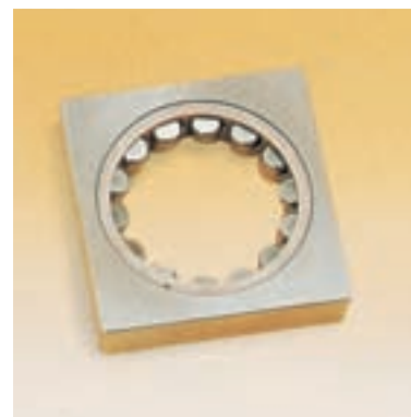
Reduction gear bearing