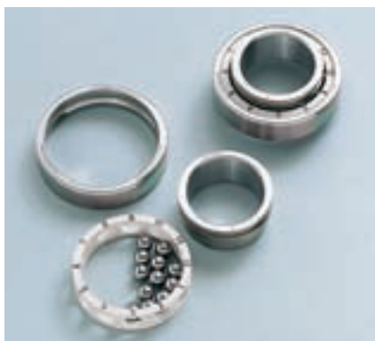
Liquid Hydrogen Turbo Pump Bearings