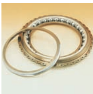
Main shaft bearing

J3 (T-1B, P-2J), JR100 (Trial Manufacture), FJR710/10 (The First Trial Manufacture of STOL), FJR710/20 (The Second Trial Manufacture of STOL), FJR710/600 (ASUKA), F3 (T-4)