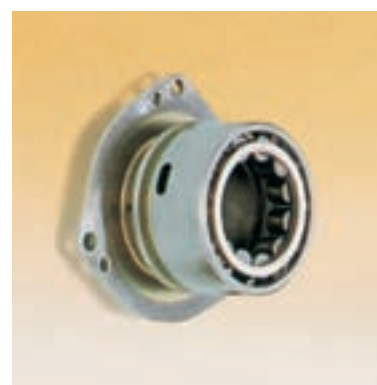
Reduction gear bearing