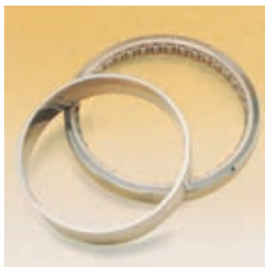
Main shaft bearing

J79-17 (F-4EJ), J805 (T-1A), T53-13B (UH-1H), T53-703 (AH-IS), T55 (CH-47), T56 (P-3C), T58 (KV-107, HSS-2), T63 (OH-6J), T64 (US-1), JT8D-9 (C-1), TF40 (F-1, T-2), F100 (F-15J), T700(SH/UH-60J)