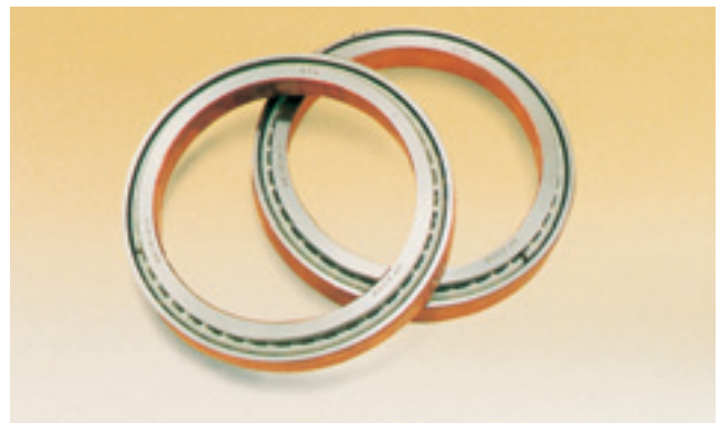
Rotor blade retention bearing

S-61 (SIKORSKY LICENCE) HSS-2/-2B (SIKORSKY LICENCE) KV-107 (VERTOL LICENCE) BK117 (Joint Development of Japan and Germany) UH-1H (BELL LICENCE) OH-6J (HUGHES LICENCE) AH-1S (BELL LICENCE) OH-1 (DOMESTIC PRODUCT) MH2000 (DOMESTIC PRODUCT) MD900/902 (Joint Development of Japan and USA) AB139 (Joint Development of Japan and Italy) SH/UH-60J/K (SIKORSKY LICENCE)