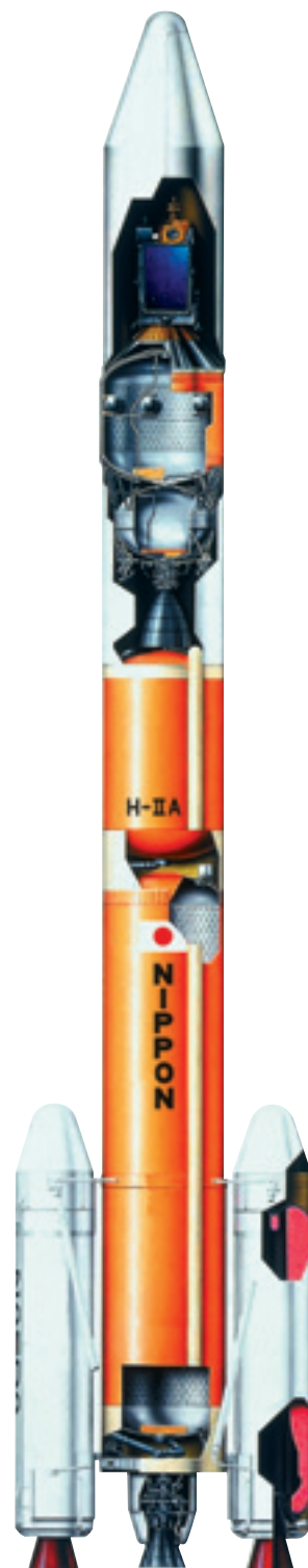
H-IIA Rocket Standard Model