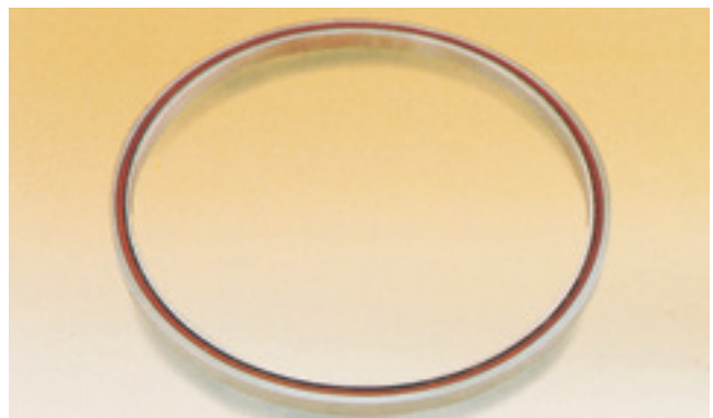
Swash plate bearing