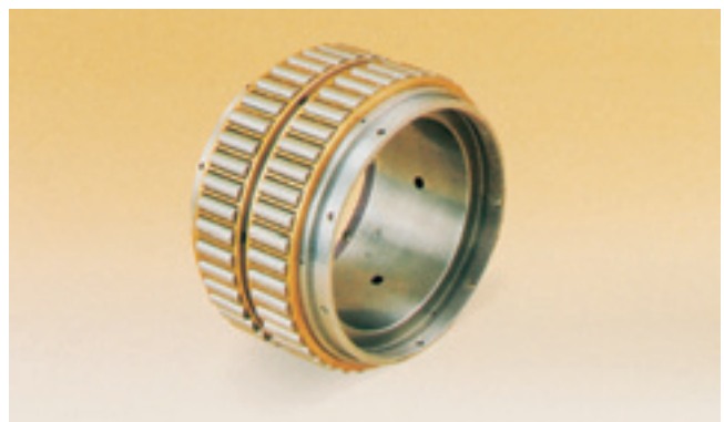
Reduction gear bearing