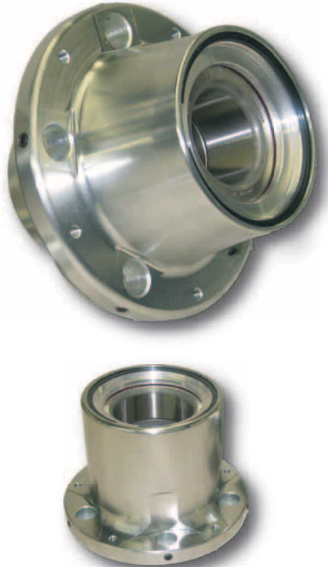
Formula Racing Wheel Hubs

While still relatively new to this market, NTN's Formula hubs are gaining popularity. NTN's hub efficiency, overall high build quality, and consistency are attributes enjoyed by numerous teams from the Craftsman Truck Series all the way to the Nextel Cup Series.