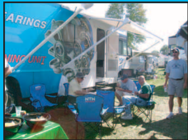
NTN Tailgating - Notre Dame vs. Michigan State Football Game (Sept, 22, 2007)