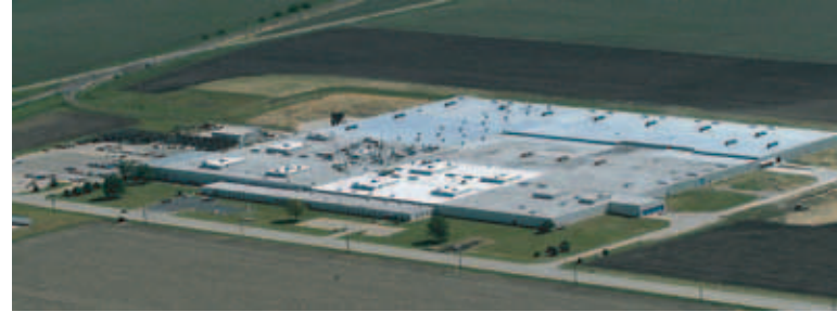
Macomb, IL Facility

NTN produces tapers in six manufacturing facilities both in the United States, as well as in Japan. In the United States, NTN has two manufacturing plants dedicated to tapered roller bearing production: Macomb, IL and Hamilton, AL. These plants are ready to meet the needs of your customers with competitive lead times.