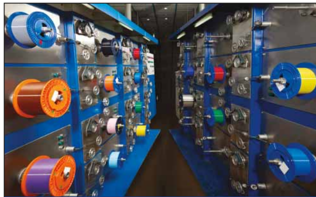
Quality Inspection of Fiber Optic Cable