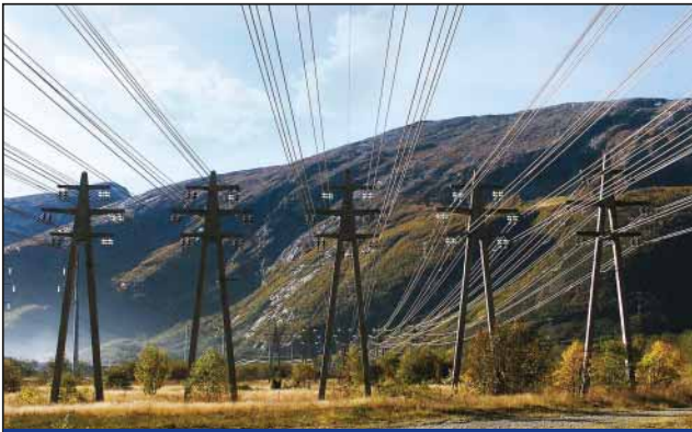
Overhead Power Line Monitoring